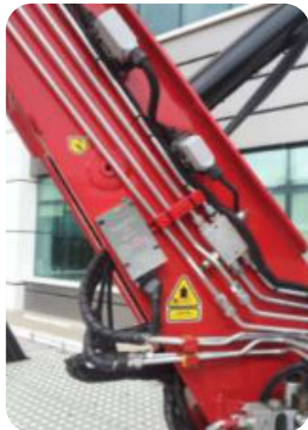
THRIFTY LED module